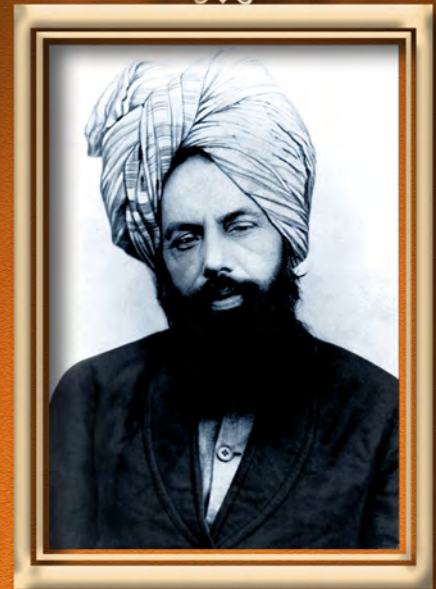
Hadhrat Mirza Ghulam Ahmad Qadiani The Promised Messiah (as)