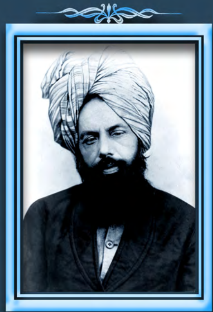
Hadhrat Mirza Ghulam Ahmad Qadiani The Promised Messiah (as)