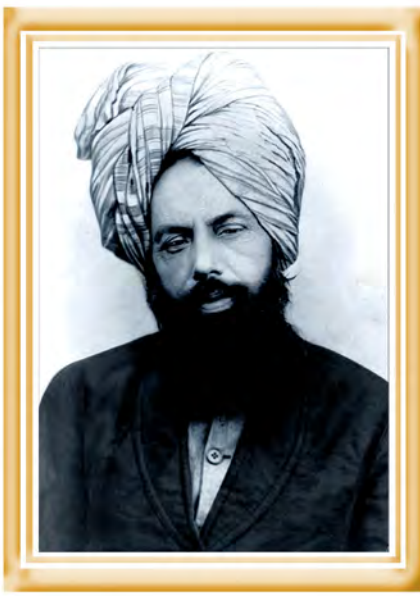
Hadhrat Mirza Ghulam Ahmad Qadiani (as) The Promised Messiah and Mehdi (as)