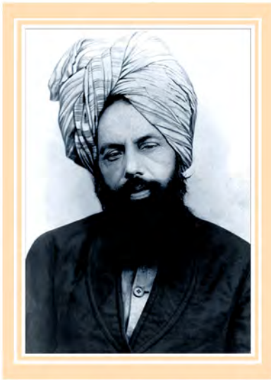
Hadhrat Mirza Ghulam Ahmad Qadiani (ra) The Promised Messiah and Mehdi (ra)