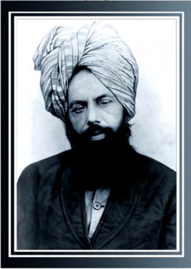
Hadhrat Mirza Ghulam Ahmad Qadiani (as) The Promised Messiah and Mehdi (as)