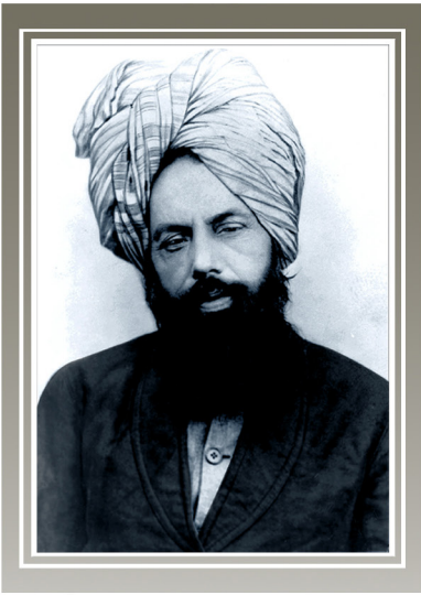
Hadhrat Mirza Ghulam Ahmad Qadiani (as) The Promised Messiah and Mehdi (as)