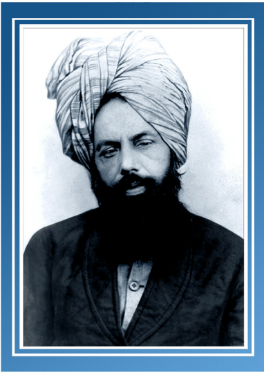
Hadhrat Mirza Ghulam Ahmad Qadiani (ra) The Promised Messiah and Mehdi (ra)