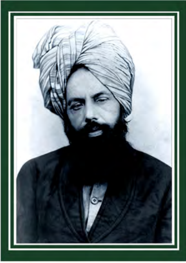
Hadhrat Mirza Ghulam Ahmad Qadiani (as) The Promised Messiah and Mehdi (as)