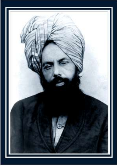
Hadhrat Mirza Ghulam Ahmad Qadiani (as) The Promised Messiah and Mehdi (as)