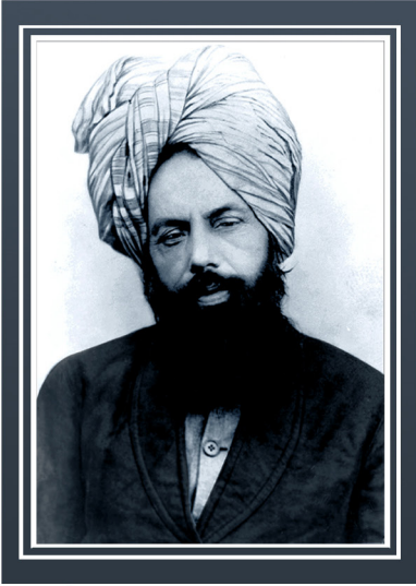
Hadhrat Mirza Ghulam Ahmad Qadiani (as) The Promised Messiah and Mehdi (as)