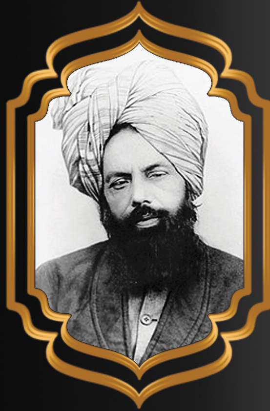
HAZRAT MIRZA GHULAM AHMAD QADIANI العلیه السلام

“Charity is not merely the giving of wealth; it is the purification of the soul and the expression of love for God’s creation.”