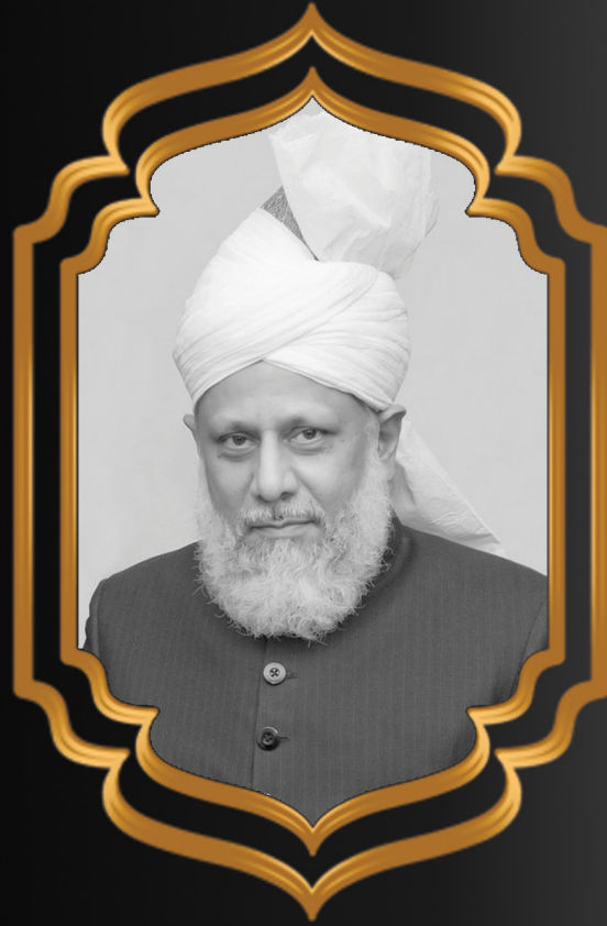
HAZRAT MIRZA MASROOR AHMAD V th CALIPH بنصره العزیز

“Do not consider Humanity First as just another charity or aid agency. Rather, directly underpinning its mission are the commands of Allah, the blessed practice of the Holy Prophet (peace and blessings of Allah be upon him), and the teachings of the Promised Messiah (peace be upon him). Unlike worldly organisations, Humanity First does not serve humanity to garner fame or recognition. Rather its every act of service rises purely from a devotion to Allah the Almighty and is inspired by His command to tend to the wounds of His Creation.”